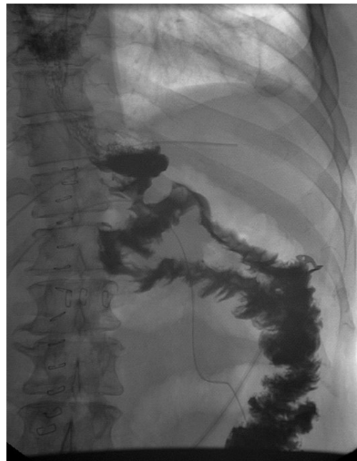
Figure 2 Diagram showing the final anatomy after OAGB. OAGB, one-anastomosis gastric bypass.

Two reviews on the performance of OAGB have demonstrated that, on average, a limb length of 200 cm has been used (5,11). However, in a trial performed by Carbajo et al. on OAGB outcomes in 1,200 patients, the length of the limb was tailored according to the candidates' BMI and comorbidities. For increasing BMIs, an additional 10 to 50 cm—with no specific formula or rationale—of afferent limb was added, maintaining a range of 250 to 300 cm of common channel (16). Similarly, Lee and colleagues adjusted the afferent limb based on the preoperative BMI. In contrast to Carbajo's outcomes, Lee et al. found